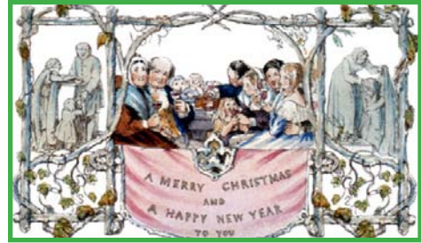
First Christmas Card

Holidays in December also have traditions. One Christmas tradition is to send cards to friends and