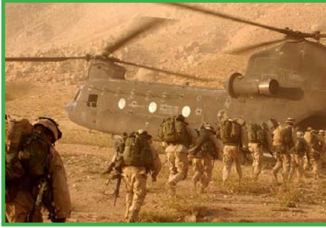
Military Service Members

Just like the family in the play, if someone in your family is away during the holidays, it